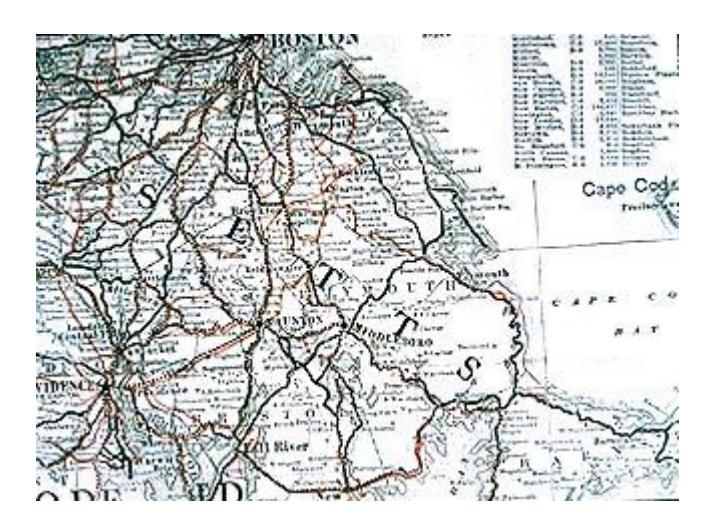
1905 Commercial Route Survey showing rail lines and trolley lines.

Trolleys were used by commuters to get to factory jobs. The trolley route passed many factories, including the Plymouth Cordage Company in North Plymouth. Children also rode the trolley to school.