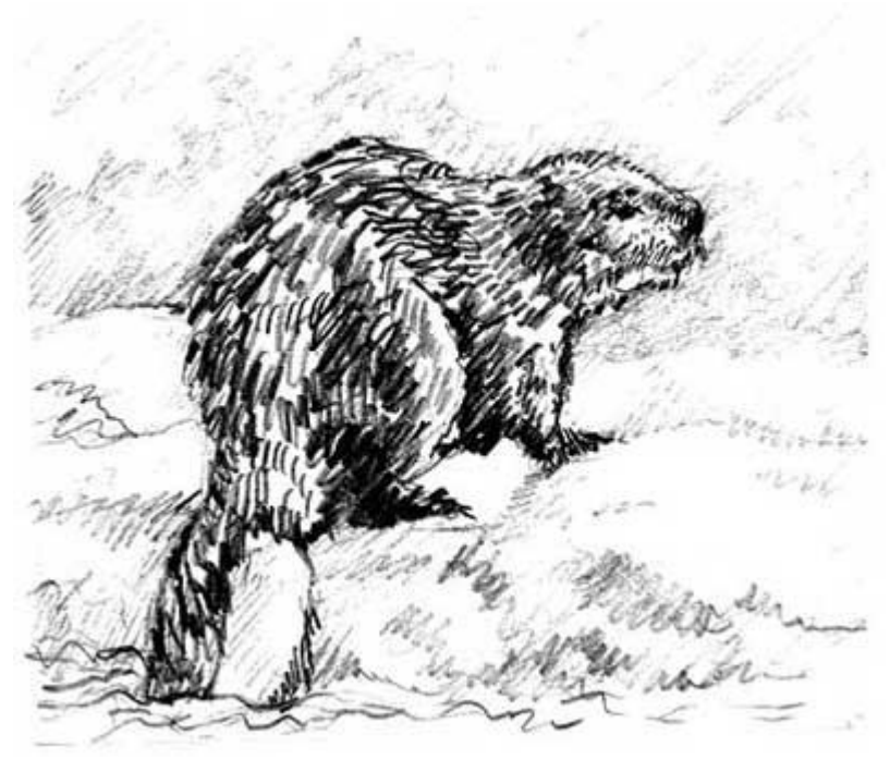
PLAYER NUMBER ONE - THE BEAVER!