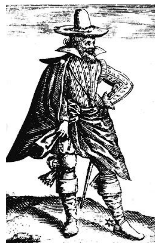
A "Gentleman" wearing a tall-crowned beaver hat, from Speed's 17<sup>th</sup> century Atlas of Britain .

The craze for high-crowned felt hats began in Europe about 1550. Quality hats demanded the best felting material available. Beaver fur is an excellent raw material; it is beautiful and holds its shape very well under rough wear and successive wettings.